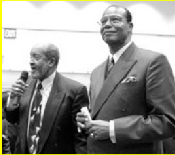
Wallace & Farrakhan at Ju'umah prayer during "Saviours' Day" (NOT SAVIOUR'S DAY) 2002